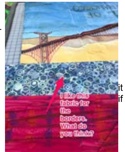
Photo to send a preview to the customer from Skitch.

Scannable is a quick way to load documents into Evernote, such as business cards, recipes, documents, etc. using your mobile phone.